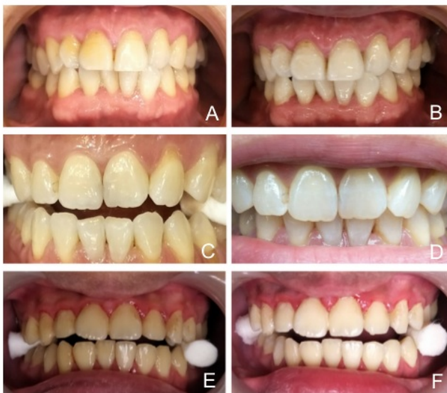
Figure 3 Clinical view of patients showing before and immediate postoperative phase of whitening treatment with iBrite in-office whitening system, A and B, Patient 8 with semi-quantitative score 9 to 7, C and D. Patient 9 with semi-quantitative score 19 to 13, E and F. Patient 10 with semi-quantitative score 18 to 12.

after tooth whitening using a low concentration of hydrogen peroxide as tingling or shooting pain. The pain scores as low as 3 represents very moderate discomfort and readily tolerable. 24