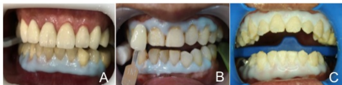
Figure 2 Clinical view of patients showing the steps of bleaching procedure using whiter image in-office whitening system, A. Patient 2 with gingival barrier in lower targeted teeth, B. Patient 3 with gingival barrier in upper and lower targeted teeth, C. Patient 4 with gingival barrier in upper and lower targeted teeth.