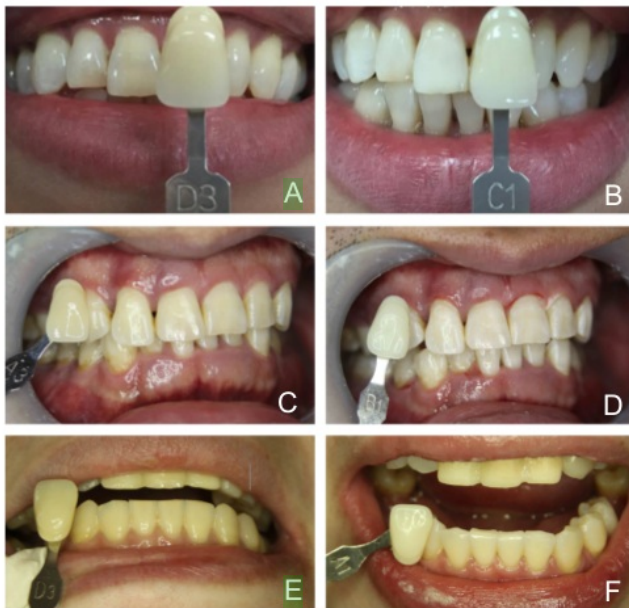
Figure 3 Clinical view of patients using the VITA shade matching in targeted teeth before and after whitening treatment, A and B. Patient 5; VITA shade before D3 and Vita shade after C1, C and D. Patient 6; VITA shade before A3 and Vita shade after B1, E and F. Patient 7; VITA shade before D3 and Vita shade after A1